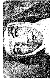
St. Mary Mackillop